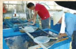
The young koi selection process After several culling operations, the number of saleable young fish is usually around 8,000 per variety.

Since the outbreak of KHV, larger entries are usually placed in an individual pools and examined individually instead of by direct comparison. So having a strong impact in their appearance is essential to win in a koi show. Making a strong impact in the judges' eye is essential to be a koi show winner.