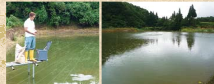
A large Niigata field pond in full blossom We feel Saki-Hikari® is a necessity for rapid growth and the development of first-rate koi.

We keep only a small number of koi in each field pond to allow them ample room to build volume. Our koi parents are also kept in the field ponds.