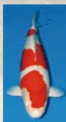
The 31st Tokai District Koi Show (2006) Grand Champion, Over 80Bu Kohaku