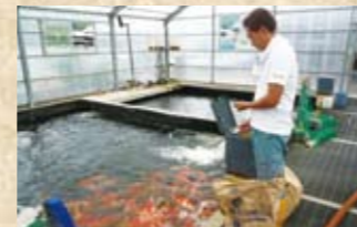
Hoshikin Kohaku gathering for their Saki-Hikari® feeding A truly splendid offering of koi.