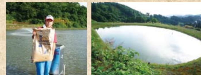
We use large-scale, natural field ponds in the mountains of Ojiya with help from the farm members residing there. This combination of natural environment and superior care help us grow the first-class koi we are known for.

Technically speaking, we've found frequent feeding with careful observation is also an important practice that brings